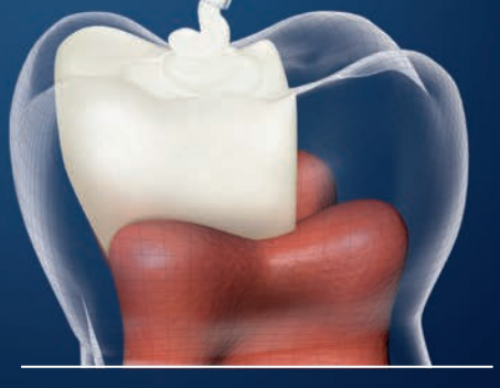
Step by step procedure